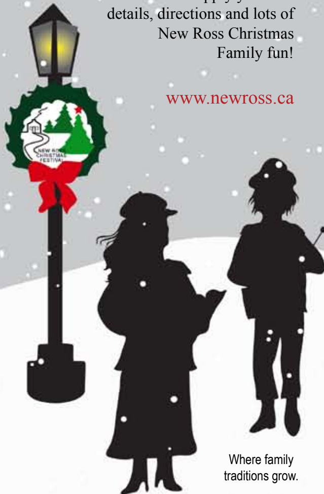
Where family traditions grow.