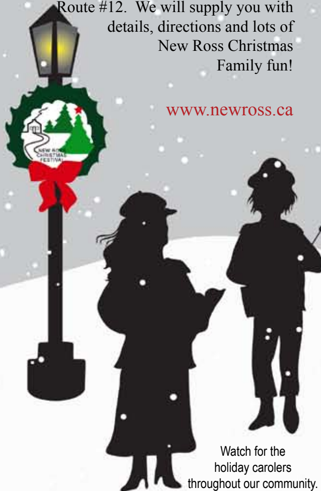
Watch for the holiday carolers throughout our community.

Help support the festival by purchasing a Festival tote bag, souvenir pin and raffle tickets for a chance to win a beautiful gift basket, which includes a stained glass window hanging of the Christmas Festival logo.